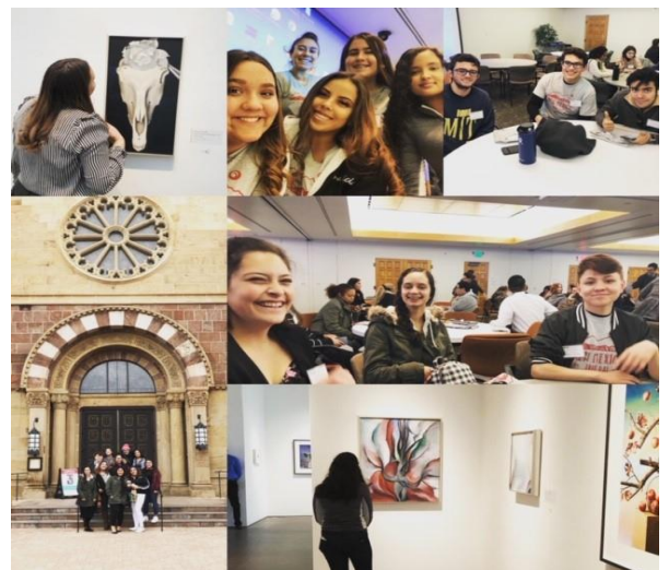
TRIO Day, Spring 2019