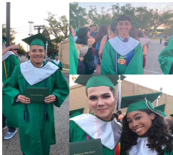
Graduating Class of 2019, Spring 2019