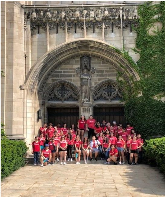
University of Chicago, Summer 2019