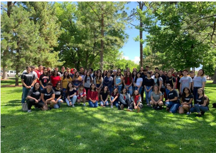
First Day of Summer School, Summer 2019