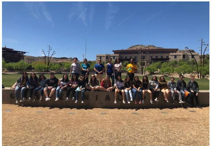
University of El Paso Texas Campus Visit, Spring 2019