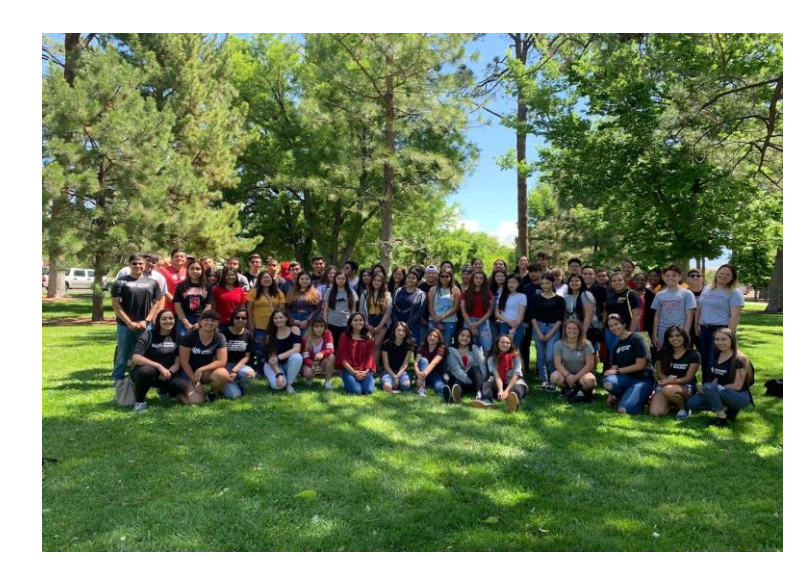
First Day of Summer School, Summer 2019