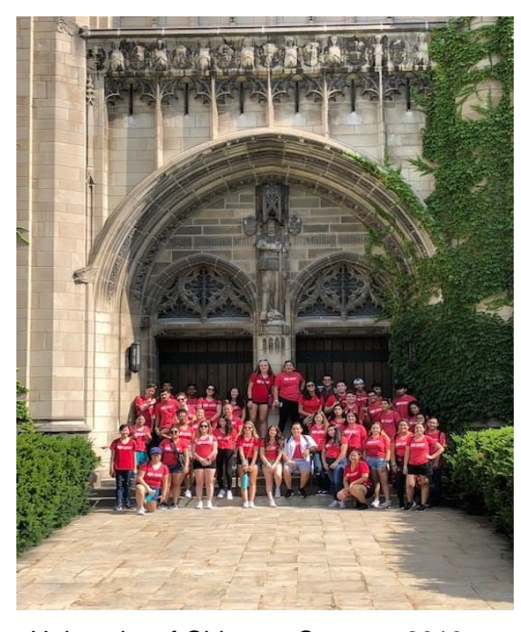
University of Chicago, Summer 2019

Note: *Extensive engagement is defined as UNM faculty being involved with more than 50% of either program planning or implementation. Moderate engagement involves faculty in 11-49%, and minimal engagement involves faculty in 0-10%