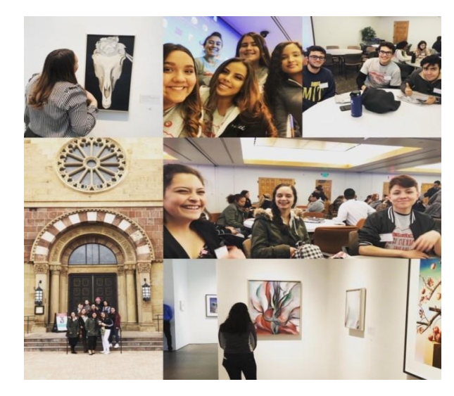
TRIO Day, Spring 2019