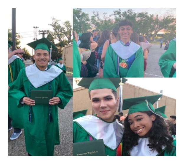
Graduating Class of 2019, Spring 2019