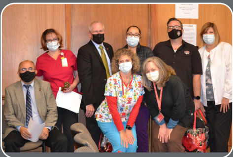
Outstanding Pack Award SHAC Clinical Team