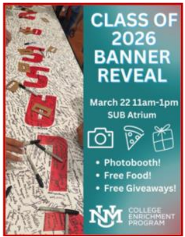
Class of 2026 Banner Unveiling

The College Enrichment Program is inviting all Lobos to join them for the unveiling of the Class of 2026 Banner in the SUB atrium on Wednesday, March 22 from 11 a.m. to 1 p.m. The event will have free food, giveaways and a photobooth. Contact CEP at 505.277.5321 for more information.