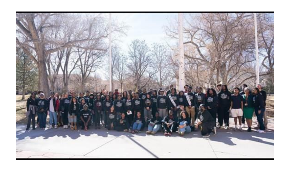
Black History Month Flag Raising Ceremony, Monday, Feb. 3.