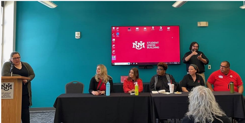
Panel discussion at DSA Onboarding Orientation.