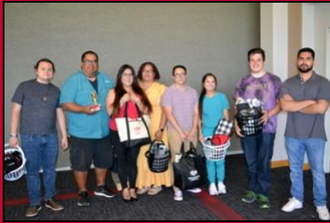
Veteran and Military Resource Center