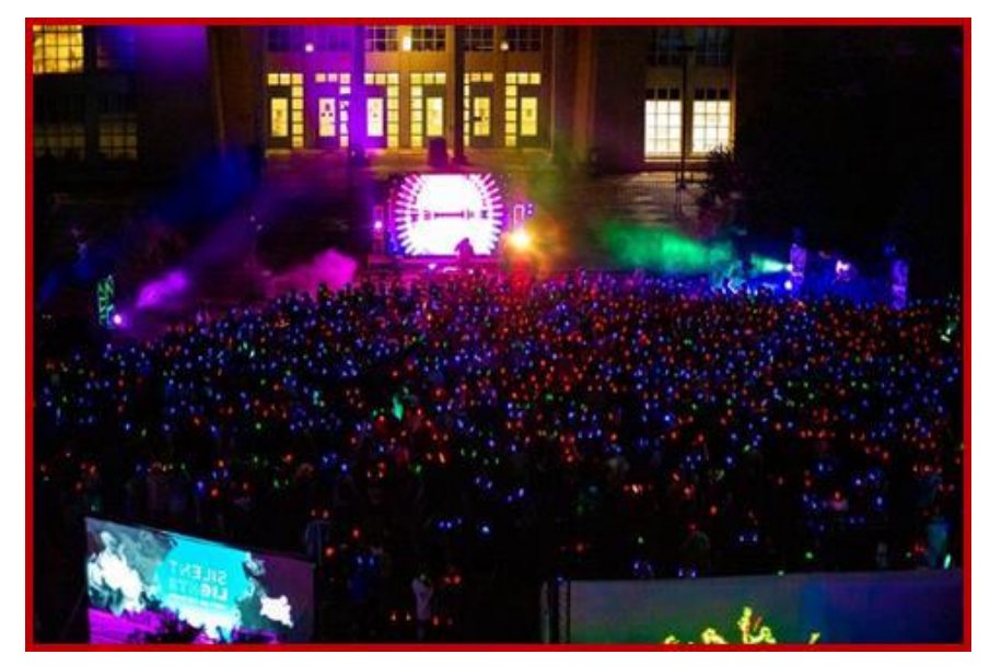
bring one guest

Get ready for a one-of-a-kind outdoor Silent Disco here, on campus. Silent Lights returns to campus tomorrow, Sept. 28 from 8-11 p.m. with 3 DJs and a massive light show in the newly remodeled Smith Plaza.